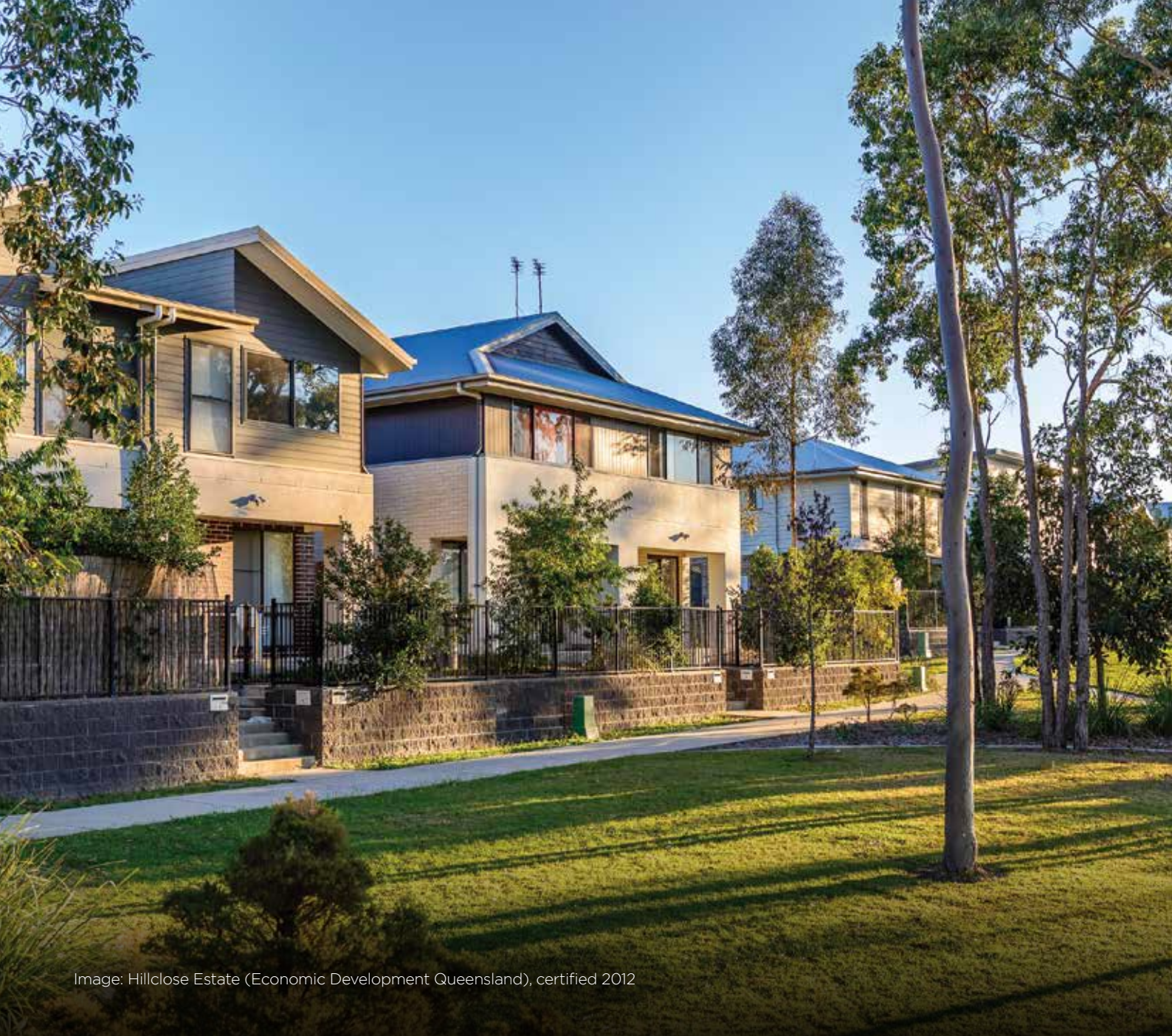
Image: Hillclose Estate (Economic Development Queensland), certified 2012